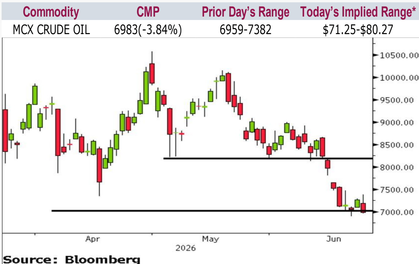
Implied range is for the Nymex front-month futures